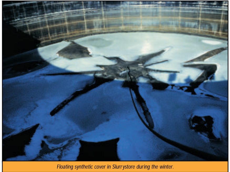
Floating synthetic cover in Slurrystore during the winter.